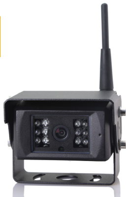
Model No. 2910000242600