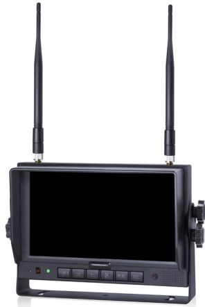
Model No. 2910000244300