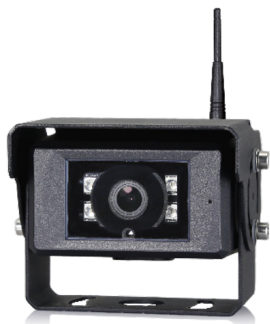
Model No. 2910000119500