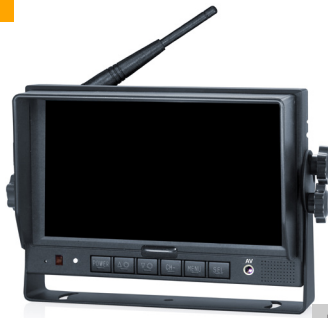
Model No. 2910000118600